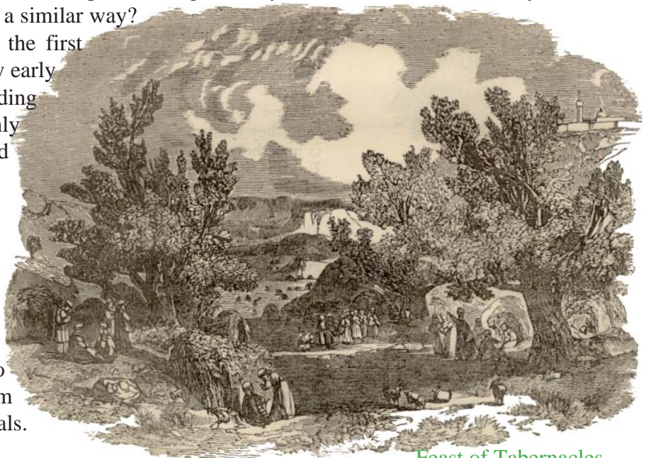
Feast of Tabernacles

There is a tremendous amount of Scripture relevant to the Messiah's fulfillment of the Biblical feast days. For those interested I have included many of them as an addendum to this chapter. I have categorized them according to their respective Festivals.