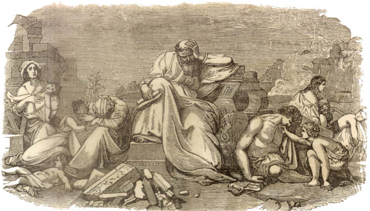
Jeremiah among the ruins of Jerusalem - Bendemann