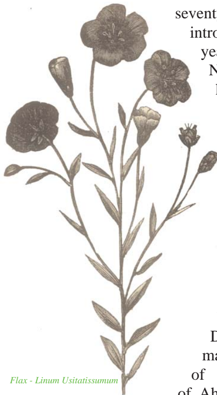
Flax - Linum Usitatissimum

Notice Daniel says he “understood” the “number of years” spoken about by Jeremiah. Daniel likely understood that his captivity under Nebuchadnezzar started the 70 years spoken of by Jeremiah. Now Daniel as an old man in the 1st year of “Darius the son of Ahasurus” by faith believed that those 70 years