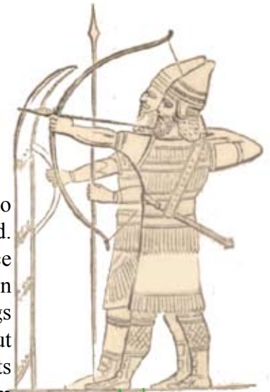
Archers from Nineveh Marbles

It took 7 years for Solomon to build and only a few days to be destroyed. The center of Jewish religious practice razed to the ground. With its destruction went the last vestige of hope that things would ever be the same. Without the Temple how could the precepts of Torah be kept? With Jerusalem destroyed and the people captive, the great pilgrimages to celebrate the religious festivals for a time were over. YHWH was angry with His people because of their sin. Jerusalem was less than a shadow of its former glory.