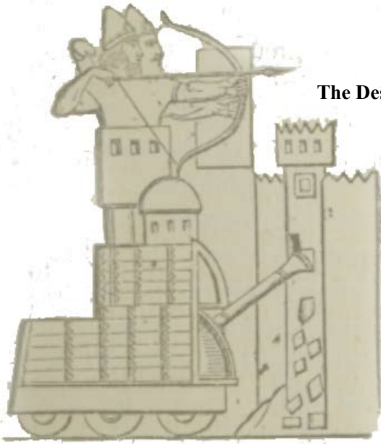
Battering Ram & Archers from Nineveh Marbles