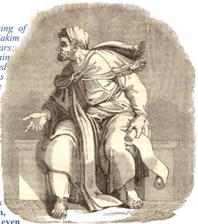
Ezekiel by Michael Angelo

then he turned and rebelled against him. .... 8 Jehoiachin was eighteen years old when he began to reign, and he reigned in Jerusalem three months. And his mother's name was Nehushta, the daughter of Elnathan of Jerusalem. 9 And he did that which was evil in the sight of YHWH, according to all that his father had done. 10 At that time the servants of Nebuchadnezzar king of Babylon came up against Jerusalem, and the city was besieged. 11 And Nebuchadnezzar king of Babylon came against the city, and his servants did besiege it. 12 And Jehoiachin the king of Judah went out to the king of Babylon, he, and his mother, and his servants, and his princes, and his officers: and the king of Babylon took him in the eighth year of his reign. 13 And he carried out thence all the treasures of the house of YHWH, and the treasures of the king's house, and cut in pieces all the vessels of gold which Solomon king of Israel had made in the temple of YHWH, as YHWH had said. 14 And he carried away all Jerusalem, and all the princes, and all the mighty men of valour, even ten thousand captives, and all the craftsmen and smiths: none remained, save the poorest sort of the people of the land. 15 And